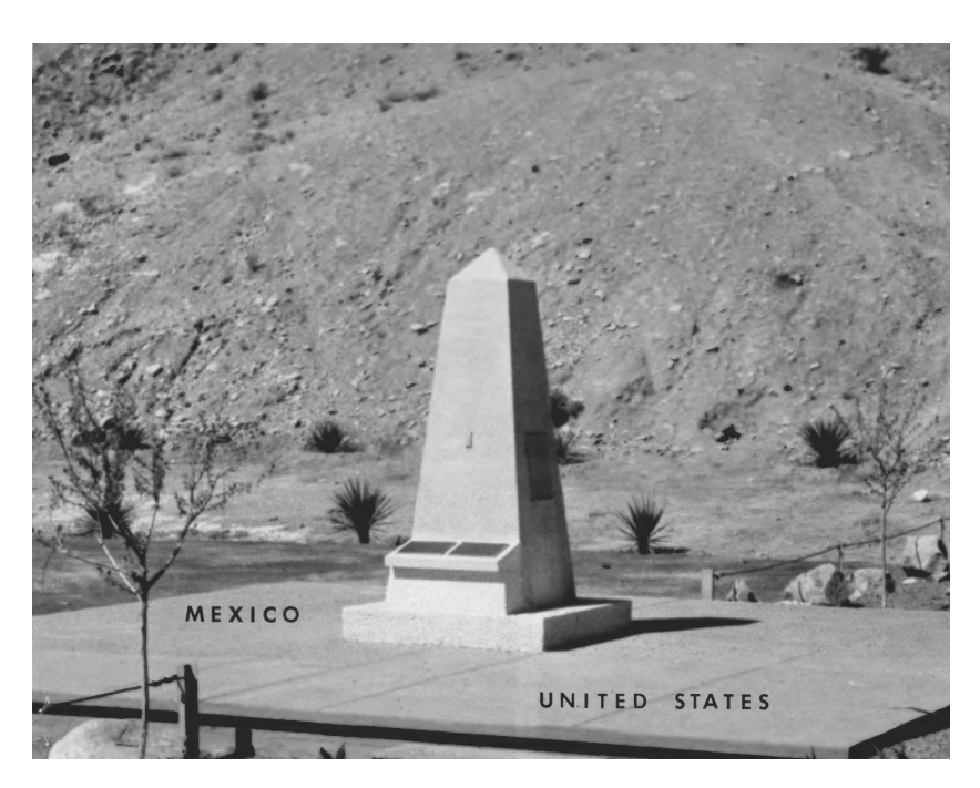
International Boundary Monument No. 1, National Register of Historic Places, April 10, 1973.

[9] See, "International Boundary Marker #1," Waymarking.com, June 17, 2011, link.