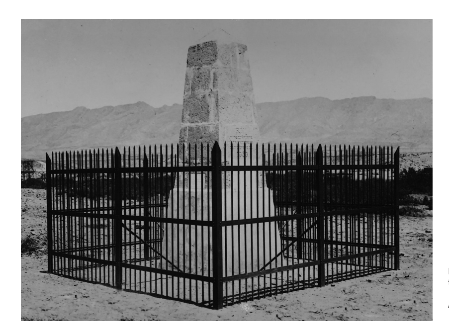
Monument No. 1 fortified with an iron fence. From the International Boundary Commission survey of 1891–1896. Photograph by J. H. Wright, US National Archives [77-MB-1-1].

to "destroy" or "mutilate" the monuments. [18] And indeed, in the forty years between the two early surveys, many of the first monuments suffered some form of destruction; although, the source of this "depredation," whether indigenous peoples, ranchers, or settlers, is unknown. Monument No. 1 "was so badly mutilated by visitors that some of the instructions had become illegible and the proportions of the stones seriously damaged." [19]