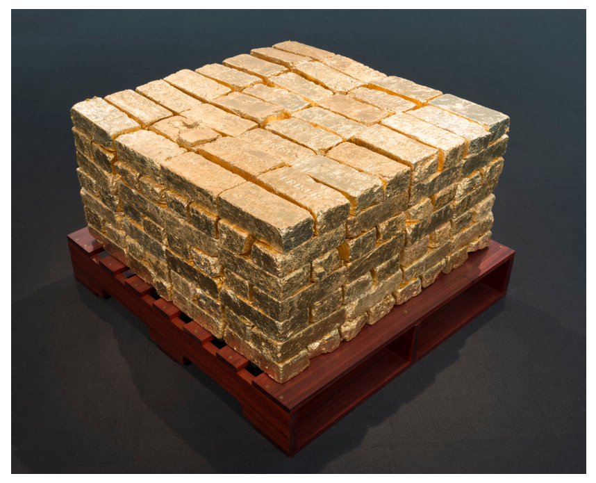
Amanda Williams, It's a Gold Mine/Is the Gold Mine?, imitation gold leaf on salvaged Chicago brick, 2016.

equally valuable, with the salvaged brick reduced to the same level of meaning as the new drywall.