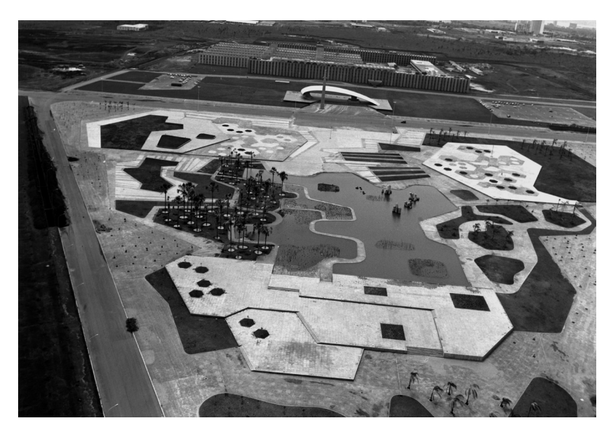
Roberto Burle Marx, aerial photograph of the garden of the Ministry of the Army [Praça das Cristais], with Oscar Niemeyer's Quartel-Geral do Exército complex seen beyond, 1972.

Burle Marx reveals, through a series of eighteen carefully crafted depositions presented to the Council from 1966 to 1974, that another talent of this "Brazilian modernist" was his rhetoric. This critically important aspect of his oeuvre is not captured by the Jewish Museum's exhibition. Burle Marx was a messenger, an early advocate for the environment, and this is one of his greatest and most powerful acts as a landscape architect, a role that today's practitioners are still striving to fill. As counselor, he argued for the designation of more national parks and natural reserves, for the conservation of cultural landscapes in the historic colonial towns of the interior, for the protection of the Botanical Gardens of Rio de Janeiro and its adjacent forest nursery, and for a more robust enforcement of the Brazilian Forestry Code that would protect the country's forests from exploitative deforestation. Burle Marx-perhaps at some personal risk, considering several implicit critiques of the regime's values that are present in his depositions—leveraged his position as counselor to argue for environmental protection from a government consumed with the modernist desire for desenvolvimento, development.