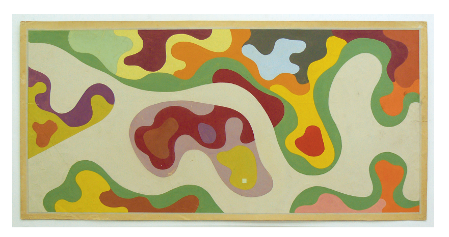
[2] The selection of plant material in many Brazilian gardens has quite a tropical colonial backstory. A later unbuilt scheme by Burle Marx for the Ministry of Education and Health plaza dating from 1944 included an amoeba-shaped pond with Victoria amazonica lily pads and a double allée of royal palm trees—two species that were embraced by Burle Marx and the modernists as indicators of the Brazilian-ness of the landscape. This is despite the fact that these giant lily pads were first discovered in British Guiana, not Brazil, and named "regia" to honor the Queen of England, and that the royal palms in Brazil are not native but descendants of the original palma mater of Rio's Jardim Botânico, an 1809 gift from the Island of Mauritius to Dom Joao VI, the Portuguese Prince Regent of Brazil and founder of the botanical garden in 1808.

Costa continued to be a significant presence in Burle Marx's trajectory as a landscape architect. An early proponent of the Instituto do Patrimônio