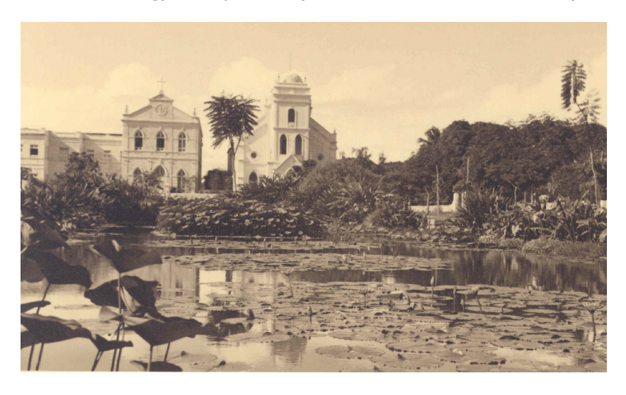
Roberto Burle Marx, Praça de Casa Forte [Garden of Casa Forte], Recife, 1938, with reflecting pool and aquatic plants. The Colégio Sagrada Família and Matriz de Casa Forte are seen beyond.