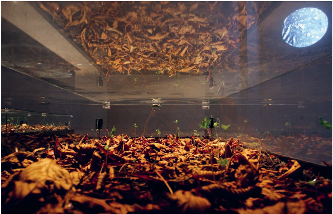
Detail of Terike Haapoja's Inhale-Exhale at the Venice Biennale (2013).

love, and bodily being, and death.” 1 The story of the carbon cycle is the story of things passing in and out of being, of transformation, of composition and decomposition. Haapoja proposes that these cycles are intimate, pulled into our most constitutive and basic elements of being. I would like to take up this proposition. How, in the midst of contemporary political debates about carbon, carbon dioxide, and carbon economies, might a shift in discourse toward affective attunement—toward an intimate engagement with the molecular—augment or intervene in those politics?