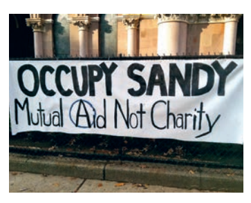
Banner from Occupy Sandy, 2011.

"stewards" of the resilient city. <sup>23</sup> Ubiquitous computing, sensors, and the constant production and reproduction of data are precisely the mechanisms through which such bonds can be weakened and new ones established. As the participants of RBD emphasize, the use of "nature-based solutions" requires a "fundamental shift" in the status of coastal communities: