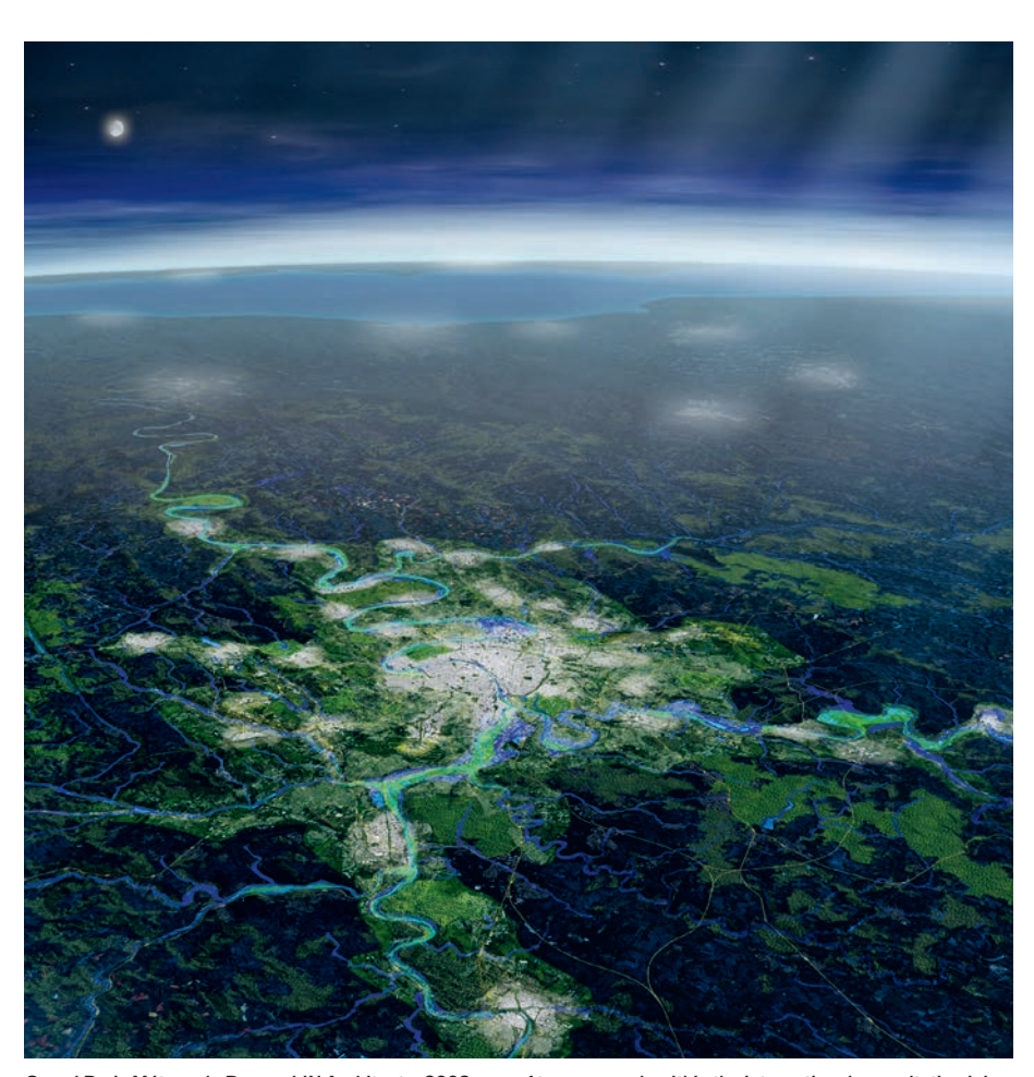
Grand Paris Métropole Douce, LIN Architects, 2008, one of ten proposals within the international consultation initiative launched by former President Nicolas Sarkozy in 2007, Grand Pari(s)—a project to reimagine Greater Paris.