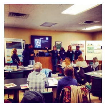
Design as pedagogy: SCAPE team members held teacher training sessions to incorporate "Oyster Gardening"—a key "nature-based solution"—into public school curricula.

From top: The "community outreach and engagement strategy" of signage to be distributed throughout the city; project strategy diagram; and diagram of multiscalar thinking.